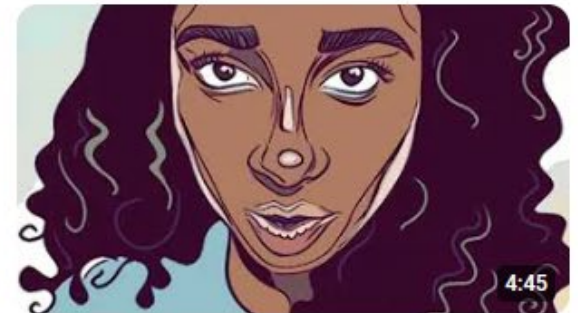
Alsa's Story: Ungrounded 14K views · 3 months ago