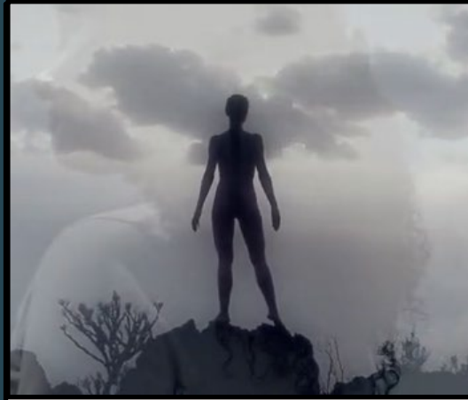
Alsa 27, Ontario