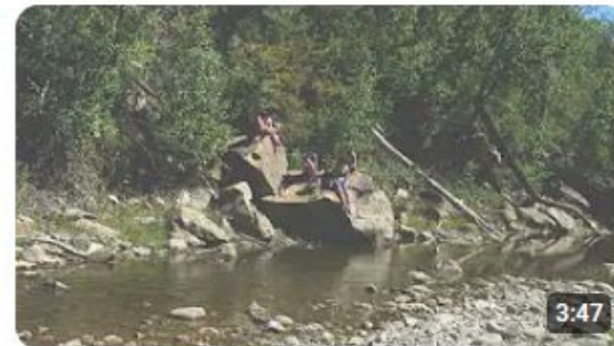
Lucky's Story: Finding Home 13K views · 3 months ago