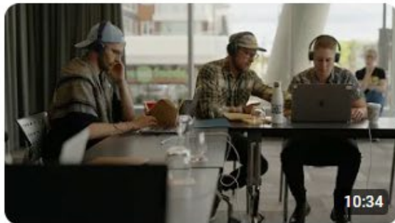
Weightless: Stories of Cannabis Harm Reduction (mini-documentary)