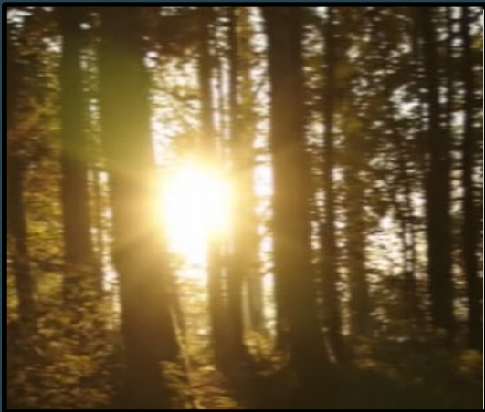
Lucky 18, Alberta