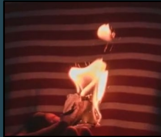
Seven 20, Alberta