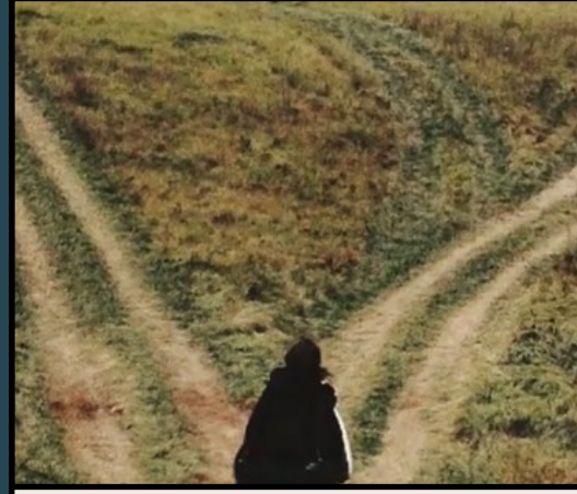
Tanya 25, Ontario